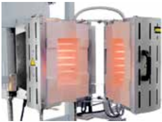
RS 100/250/11S in split-type design for integration into a test stand

With their high level of flexibility and innovation, Nabertherm offers the optimal solution for customer-specific applications.