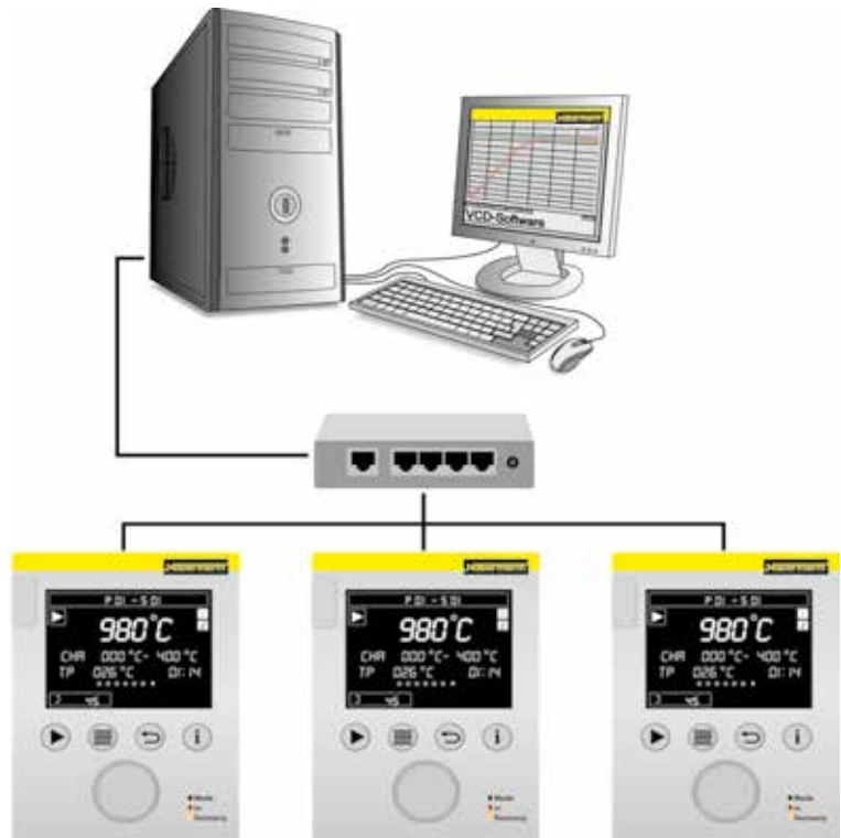
Example lay-out with 3 furnaces