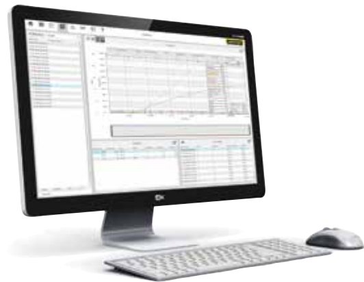
VCD Software for Control, Visualisation and Documentation