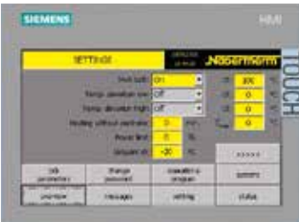
H1700 with colored, tabular depiction