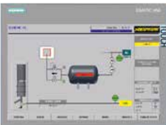
H3700 with colored graphic presentation

Nabertherm has many years of experience in the design and construction of both standard and custom control alternatives. All controls are remarkable for their ease of use and even in the basic version have a wide variety of functions.